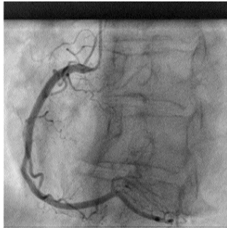
Figure-1: Coronary angiography: Selective left coronary artery angiography (A) and right coronary artery angiography (B) shows no angiographically detectable coronary artery disease.